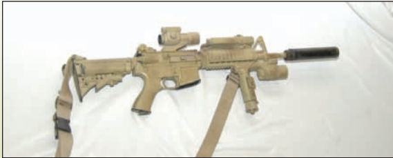
5.56mm M4 SOPMOD Rifle