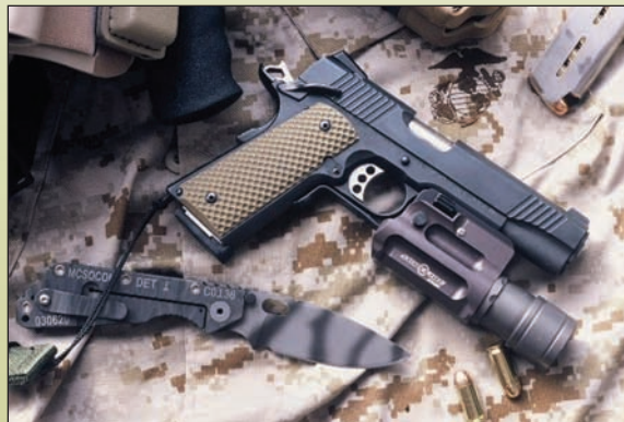
.45-caliber M1911 Pistol and Stryder Knife