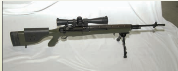
7.62mm M14 Rifle