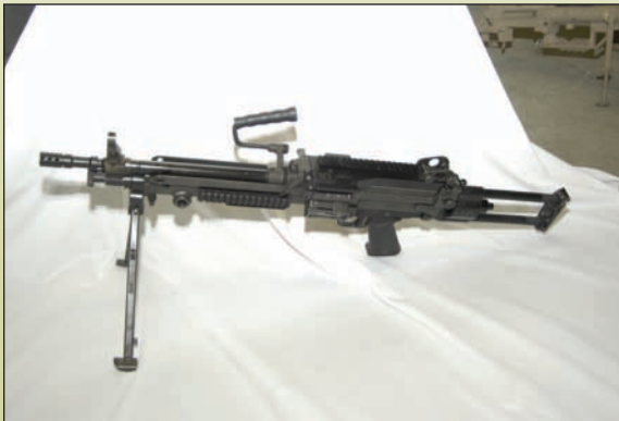
5.56mm M249 Light Machine Gun