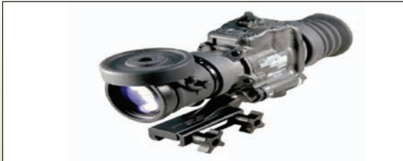
AN/PVS-17 Weapon Night Sight