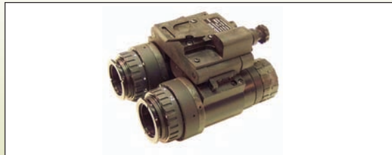
AN/PVS-15 Binocular Night Sight