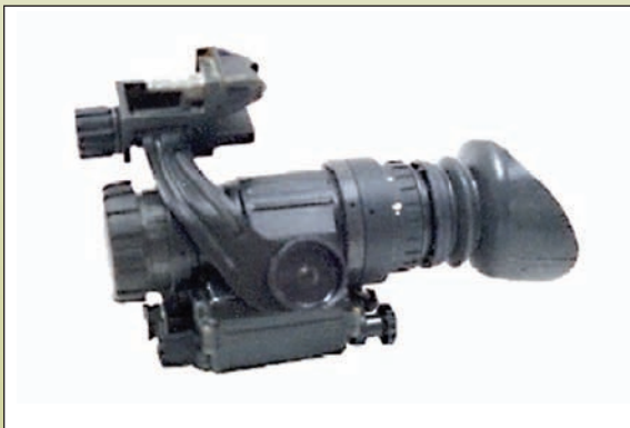
AN/PVS-14 Multipurpose Night Sight