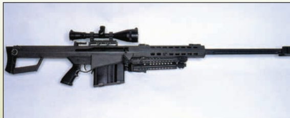
.50-caliber M82 Barrett