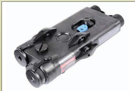
PEQ-2A IR Laser Pointer